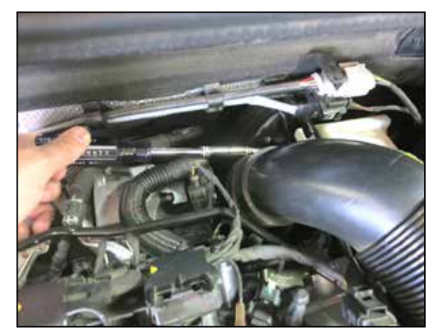
3. Loosen the hose clamp at the turbocharger and disengage the intake hose from the turbo inlet.