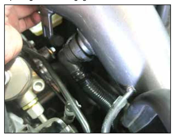
10. Position the AEM intake tube in the engine bay and connect the small vacuum hose to the small nipple. Move the large air injection hose behind the AEM heat shield and connect it to the AEM intake tube. Soapy water should be used to help installation. Note: Not all models have this large hose. Install the included blind plug (8-215) in its place. On vehicles that the factory vacuum line is too short, use the provided union and vacum line to complete the connection.