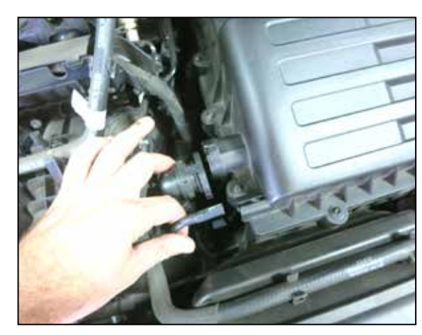
4. Remove small vacuum line from the stock air box. Remove the large air injection hose by depressing the ribber parts of the collar. Note: Not all models will have this large hose.