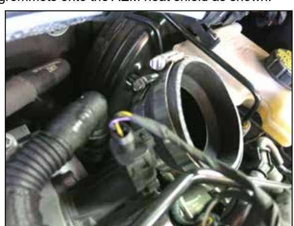
7. Install the provided coupler and hose clamps onto the turbo with the small end towards the turbo inlet. Tighten the turbo-side hose clamp to 30in-lb.