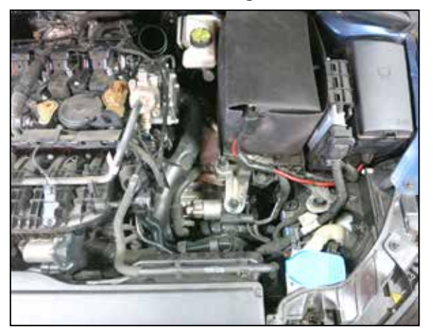
5. Remove the stock air box and intake hose assembly from the vehicle by pulling upwards to disengage the three rubber grommets. Lift the hose side first and maneuver the box towards the rear. clearing the cold air inlet.