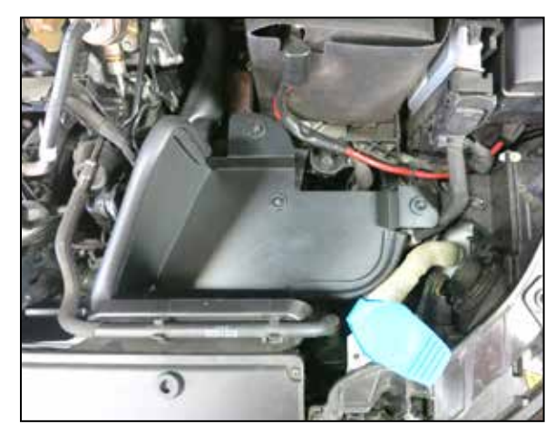
9. Install the AEM heat shield onto the factory air box mounting studs. Soapy water may be used to help the grommets engage with the studs.