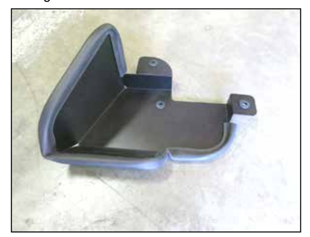
6. Install the provided edge trim and rubber grommets onto the AEM heat shield as shown.