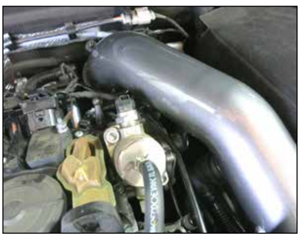
11. Lower the AEM intake tube bracket onto the rubber mount, between the washer and rubber mount, and insert the tube into the coupler. Do not tighten the mount or coupler at this time.