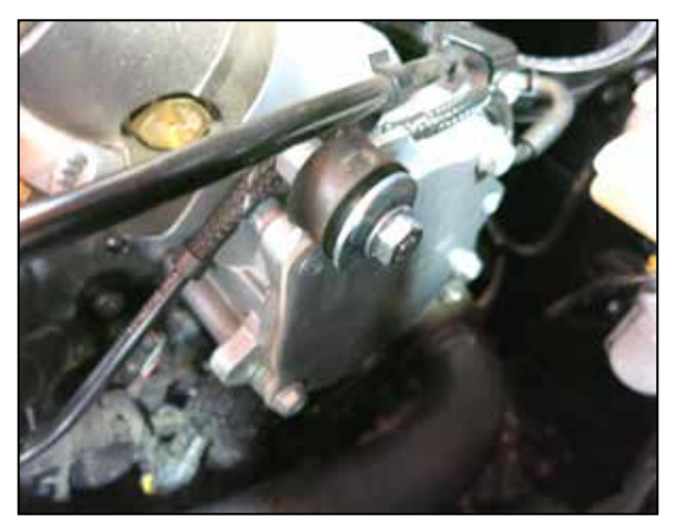
8. Install the provied rubber mount onto the side of the engine. Loosely install the provided washer and nut onto the tuber mount.