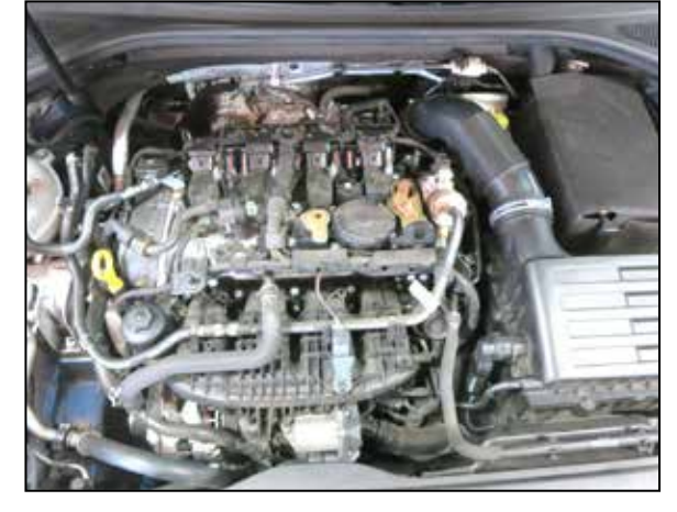
2. Remove the plastic engine cover by pulling up gently, releasing it from the rubber grommets.

NOTE: Disconnecting the negative battery cable erases pre-programmed electronic memories. Write down all memory settings before disconnecting the negative battery cable. Some radios will require an anti-theft code to be entered after the battery is reconnected. The anti-theft code is typically supplied with your owner's manual. In the event your vehicles anti-theft code cannot be recovered, contact an authorized dealership to obtain your vehicles anti-theft code.